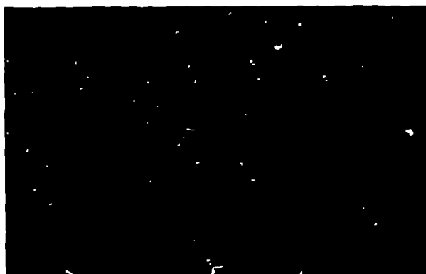
Figure 2. Time resolved absorption spectrum of ruby under shock loading. The xenon emission lines occur at the start of the streak, and the absorption shifts under compression can clearly be seen.

time resolved spectrum. A photograph of the spectrum for a 10 11 kbar experiment is shown in figure 2.